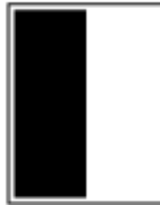
1/2 Pg. Vert. 3 1/2" x 9 5/8"