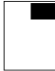
1/8 Pg. 3 1/3" x 2 1/2"