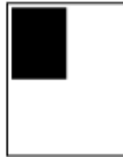
1/4 Pg. 3 1/3" x 4 13/16"