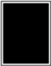
Full Pg. 7" x 9 5/8"

Premium Positions: Back Page = 30% (black & white) Inside Covers = 15% (black & white)