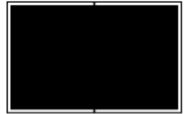
Double Truck 15 1/2" x 9 5/8"

Classified rates $50 for up to 50 words and $1.50 for each additional word Discounts: 12-25x:10% • 26-39x:15% • 40-52:20%